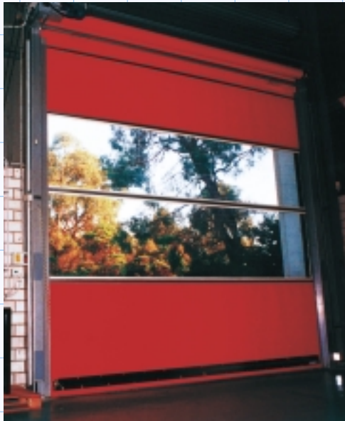
Combinations of clear sections to suit any application