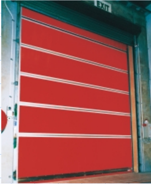
Large doors in exposed environments