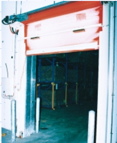
Special designs for freezers operating at - 30°C