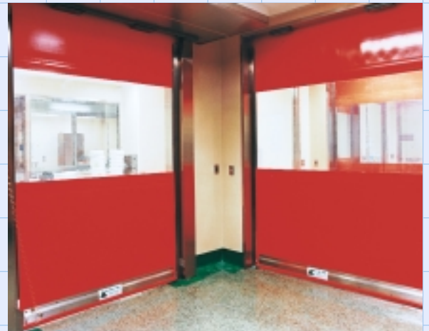
Stainless steel framing for special clinical or laboratory conditions

DMF International has been at the forefront of the Rapid Roll door industry for many years, and is Australia's largest exporter of this type of door. With full engineering design and manufacturing facilities, DMF has the capabilities to produce the right solution for your application.